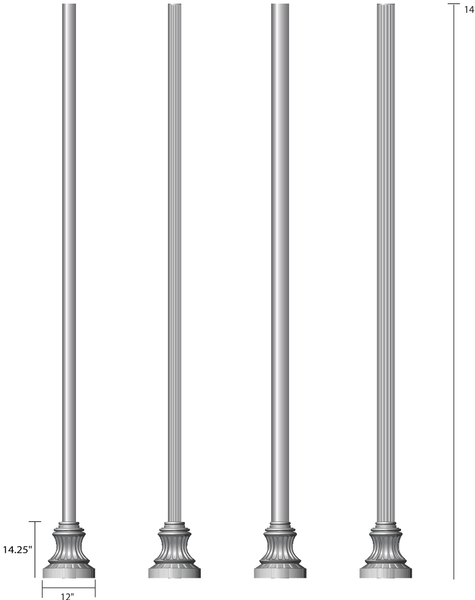
4" O.D. FLUTED ALUMINUM 14' MAXIMUM HEIGHT